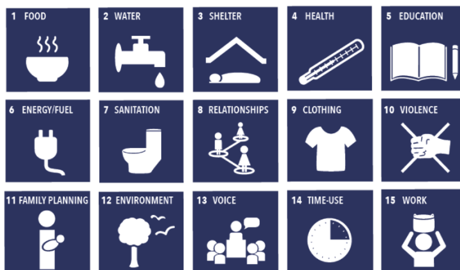
Figure 41.1. The fifteen dimensions of the Individual Deprivation Measure

Source: The Individual Deprivation Measure's website: http://www.individualdeprivationmeasure.org/idm/methodology/ .